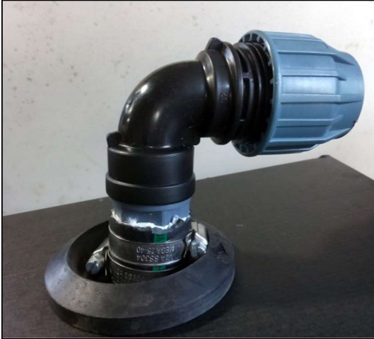
Push the Hose Bung (Grommet) into the hole