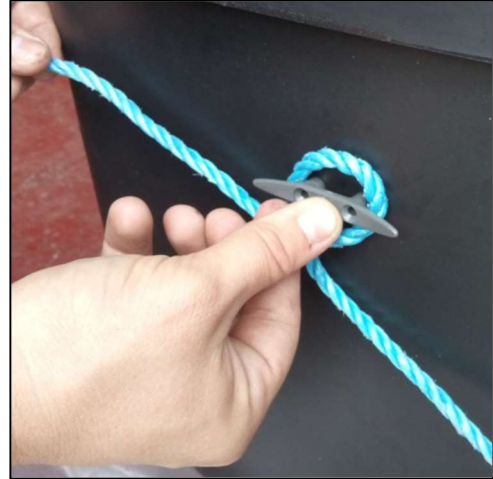
Attach the Rope Cleat outside the Tank