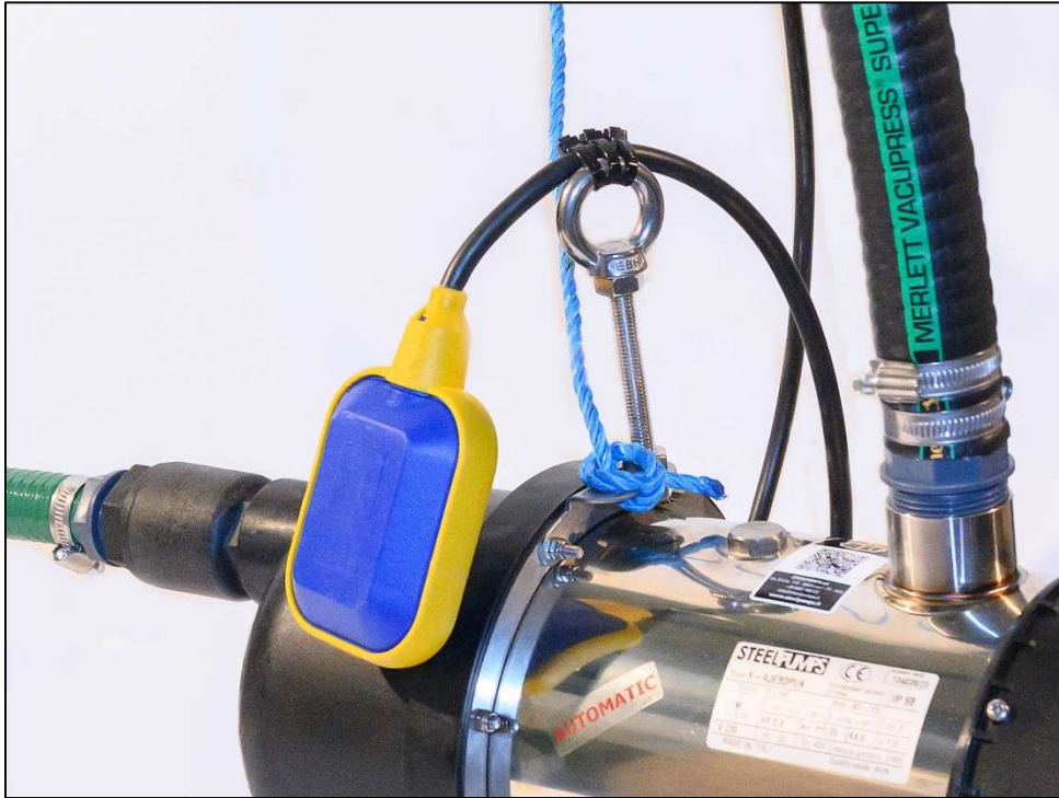
SteelPump showing Threaded bar, Float Switch and Lifting Rope